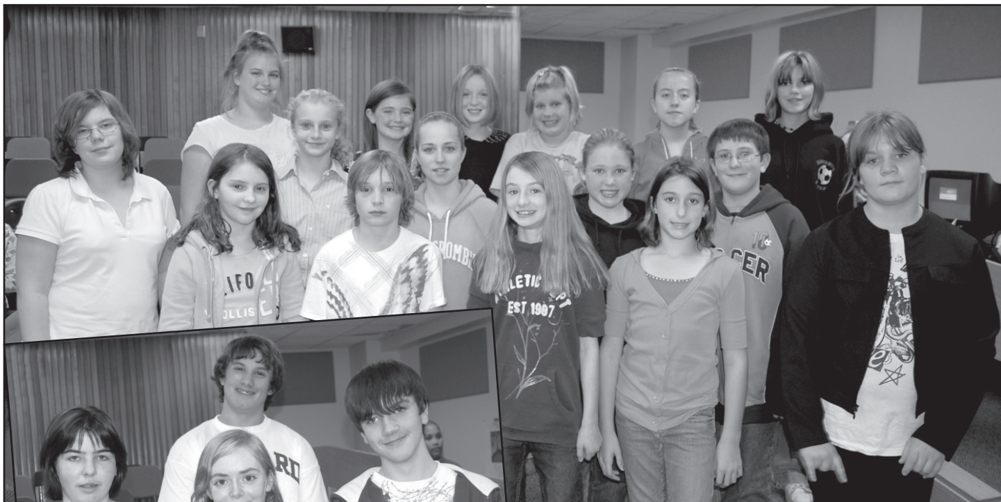
Above: 2008-09 KVV group