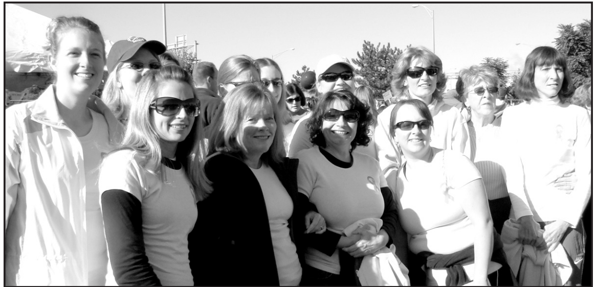
KCTA members along with community and family members pose for a picture at the Making Strides Against Breast Cancer walk in Rochester.

Adorned in pink, members of the Keshequa Central Teachers' Association, Keshequa staff, and community members met on Sunday, October 5, at Frontier Field in Rochester for a common cause. The group represented Keshequa Central School District in the Making Strides Against Breast Cancer walk sponsored by the American Cancer Society.